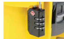
TSA approved padlock