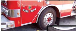
PowerFlare light being run over by a fire truck