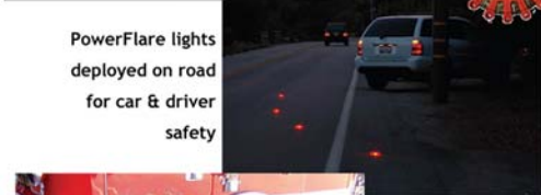
PowerFlare lights deployed on road for car & driver safety