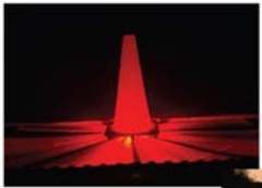
PowerFlare light under a traffic cone