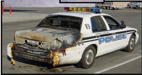
Accidental Combustion of Fusee Flares in Trunk of Police Car