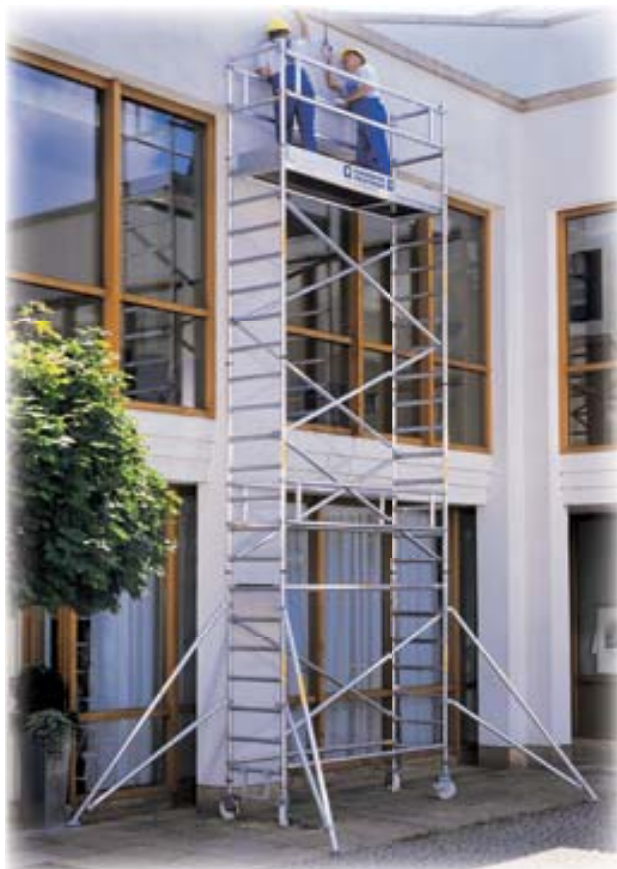
Fig. Order No. 178635