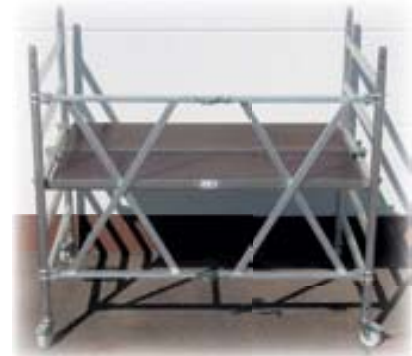
Fig. Order No. 115401

The unit is delivered partly assembled. Once assembled completely, the scaffolding can be opened and closed in a matter of seconds.