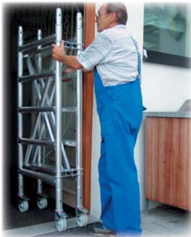
Fig. Order No. 27945