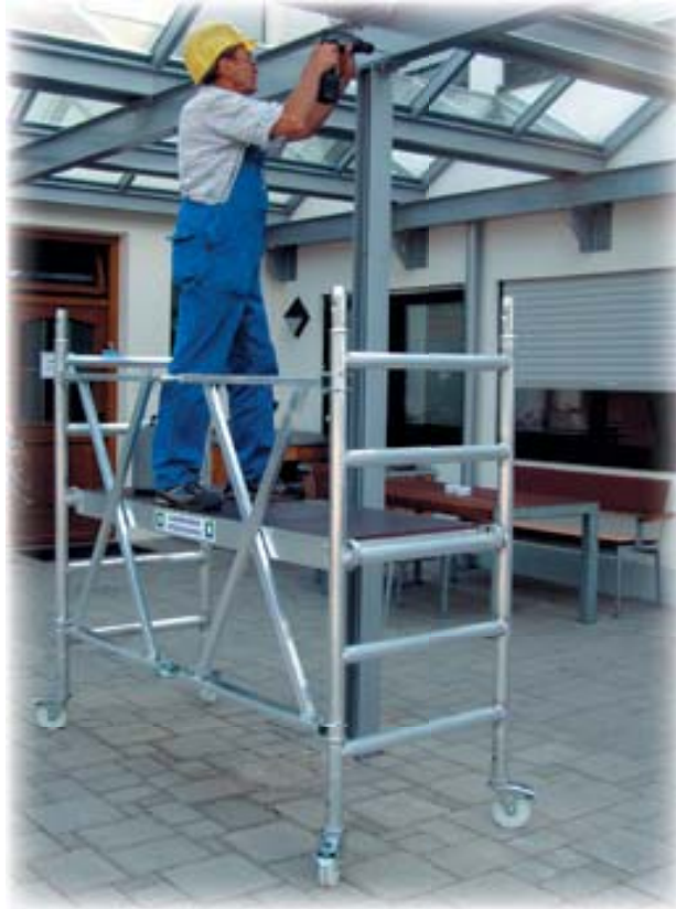
Fig. Order No. 115301